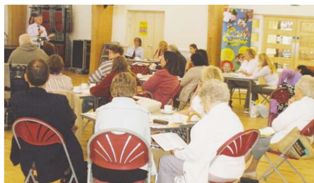
All pictures are of the the Health and Social Care Event