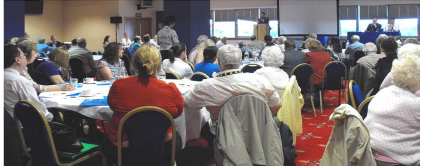
Pictures on this page show a some of the attendees at the LINK Regional Conference 2009

In 2005 the Department of Health announced that LINKs would be established within each area that is served by a local authority with responsibility for social services. This meant that there would be 150 LINKs across the country. Their roles would be set out in legislation and their primary role would be to enable local individuals and groups to actively influence local care services, from planning and commissioning, to delivery.